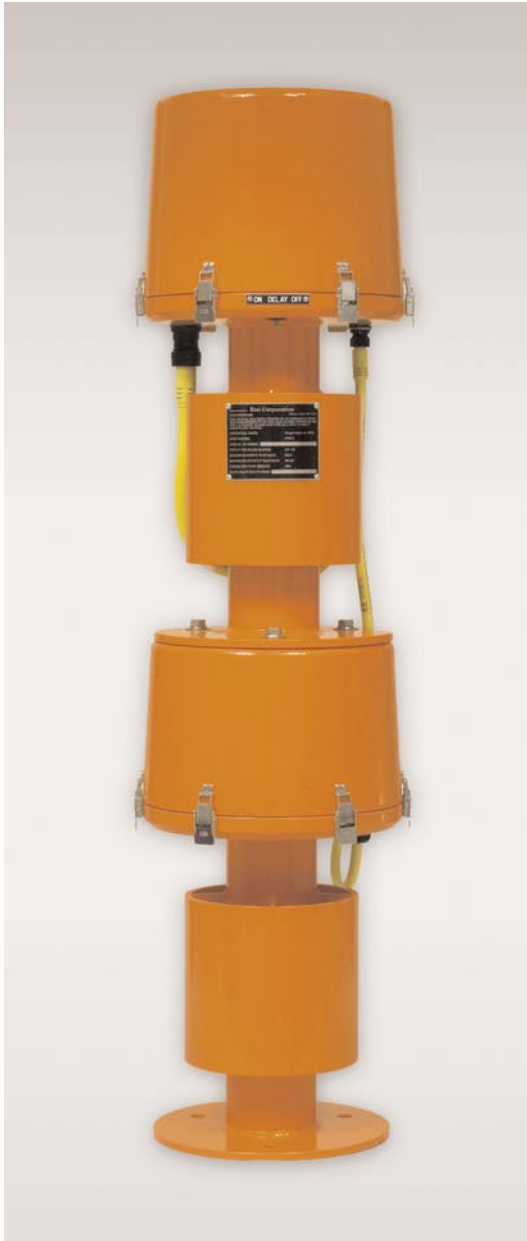
FaradicWave (FW/6) Fog Signal